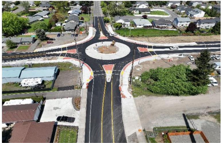
New roundabout at NE 99th Street & NE 94th Avenue.