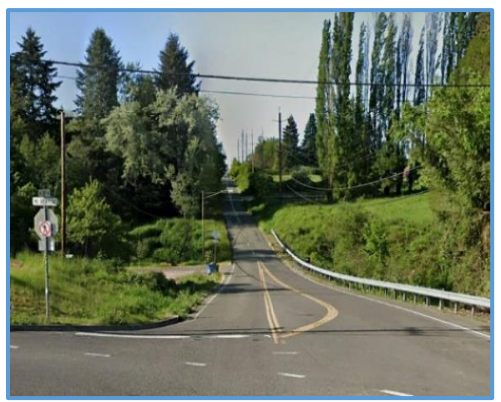
Before NE 10th Avenue near NE 148<sup>th</sup> Street Looking North