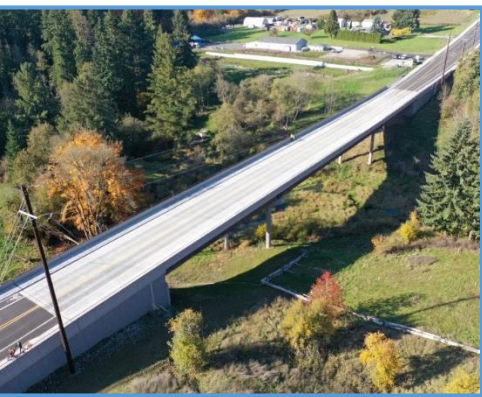
After NE 10th Avenue at Whipple Creek Looking North