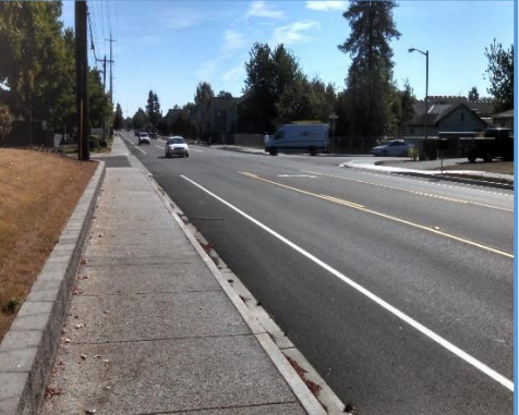
Before NE 10th Avenue at NE 149<sup>th</sup> Street Looking South