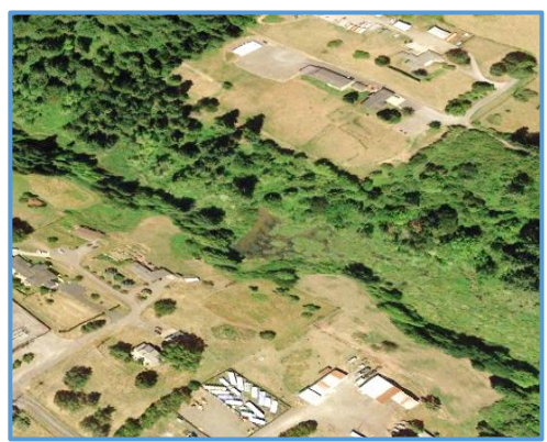
Before NE 10th Avenue at Whipple Creek Looking North