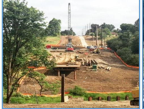
Construction NE 10th Avenue at Whipple Creek Looking North