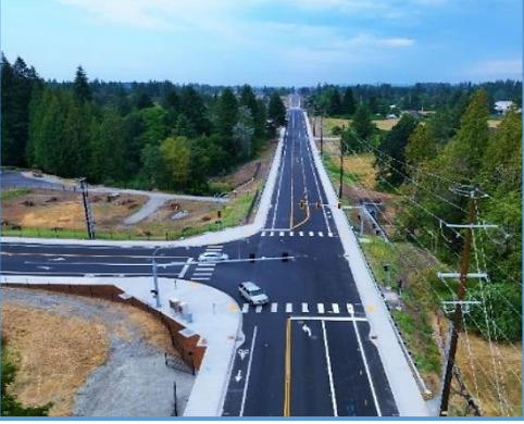
After NE 10th Avenue near NE 148<sup>th</sup> Street Looking North